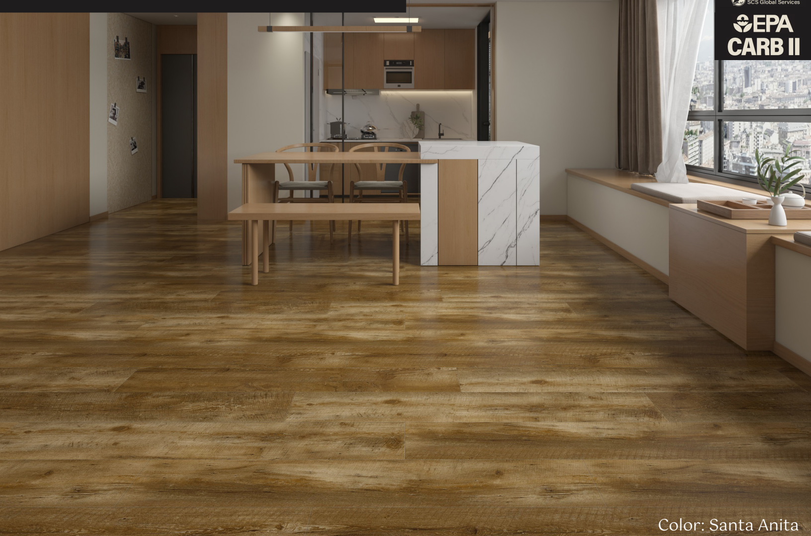
Color: Santa Anita