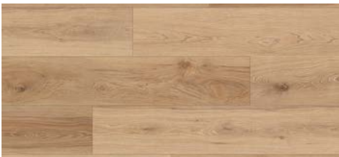
LI-DM05 Overland Park