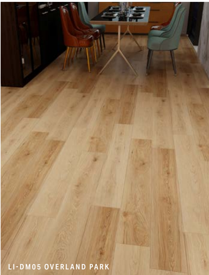
LI-DM05 OVERLAND PARK