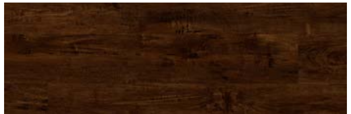
LI-DT08 Clayton | LI-DP08 Capitol Hill