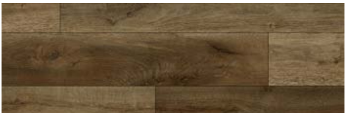
LI-DT09 Bellevue | LI-DP09 Plano