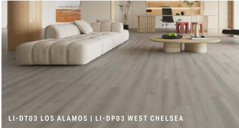
LI-DT03 LOS ALAMOS | LI-DP03 WEST CHELSEA