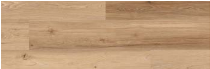
LI-DT05 Brighton | LI-DP05 Sun Valley