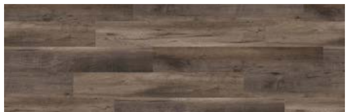
LI-DT12 Westfield | LI-DP12 Roseville