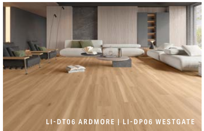
LI-DT06 ARDMORE | LI-DP06 WESTGATE