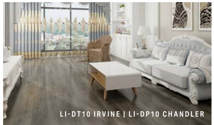
LI-DT10 IRVINE | LI-DP10 CHANDLER