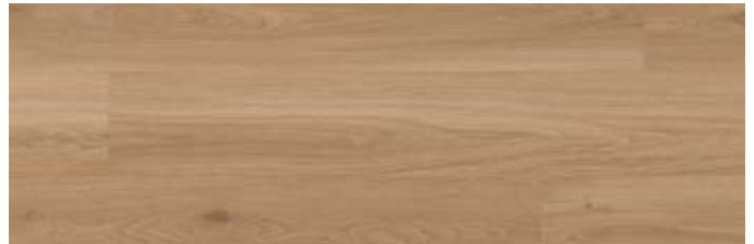
LI-DT06 Ardmore | LI-DP06 Westgate