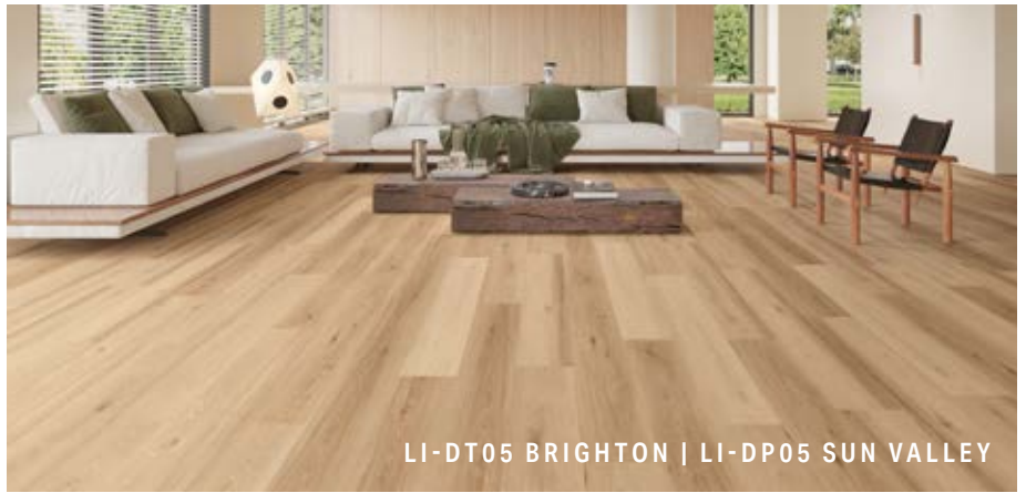
LI-DT05 BRIGHTON | LI-DP05 SUN VALLEY