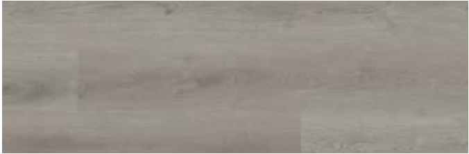
LI-DT03 Los Alamos | LI-DP03 West Chelsea