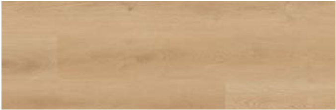
LI-DT01 Billings | LI-DP01 Marquee