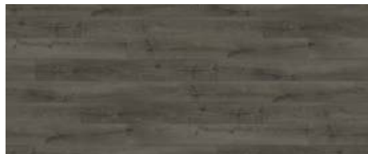
LI-DT10 Irvine | LI-DP10 Chandler