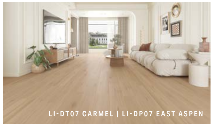
LI-DT07 CARMEL | LI-DP07 EAST ASPEN