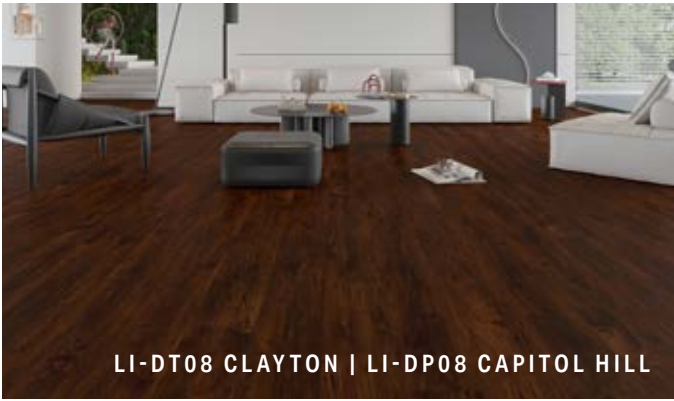
LI-DT08 CLAYTON | LI-DP08 CAPITOL HILL