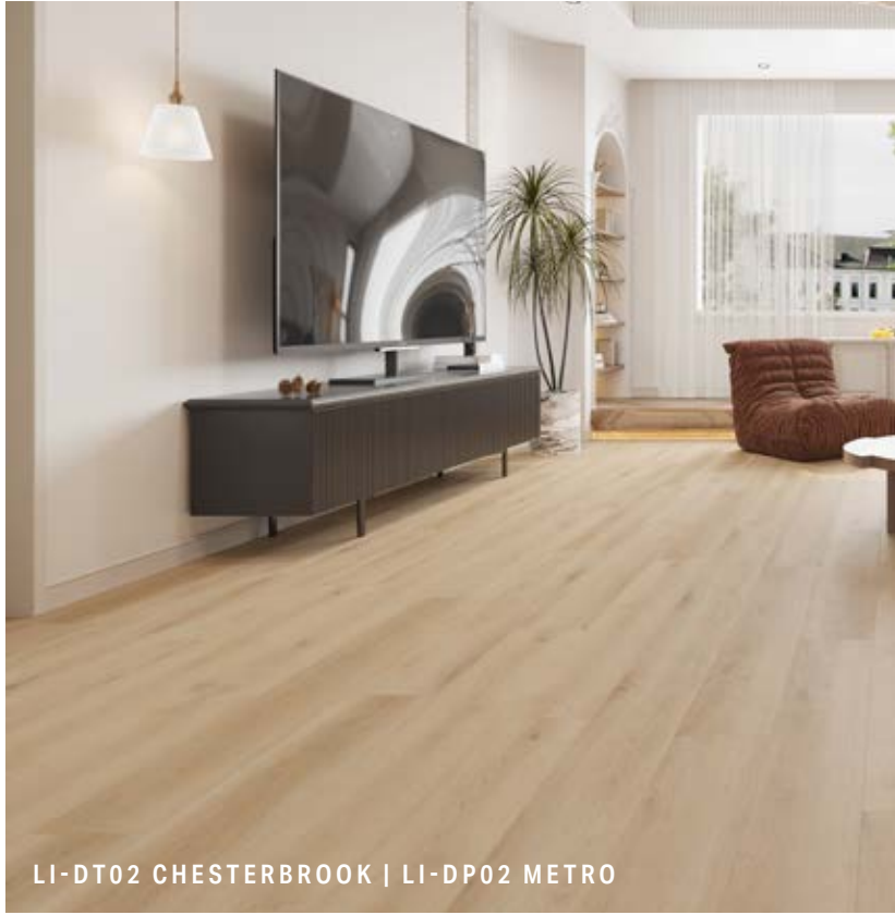
LI-DT02 CHESTERBROOK | LI-DP02 METRO