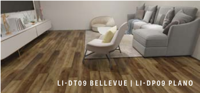
LI-DT09 BELLEVUE | LI-DP09 PLANO