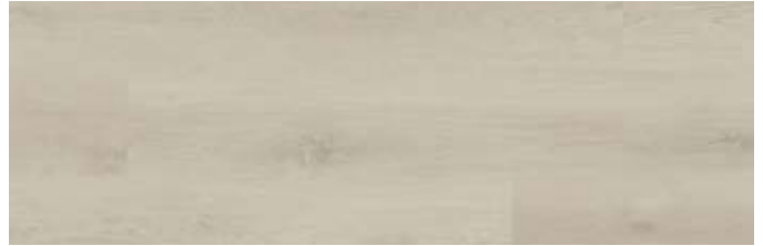
LI-DT04 Brentwood | LI-DP04 Midtown East