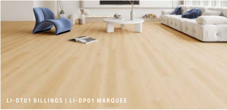
LI-DT01 BILLINGS | LI-DP01 MARQUEE