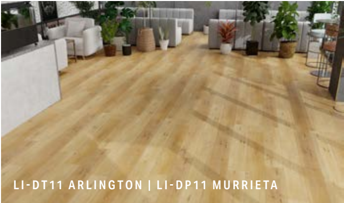
LI-DT11 ARLINGTON | LI-DP11 MURRIETA