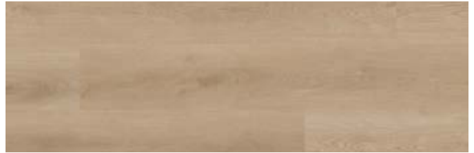
LI-DT02 Chesterbrook | LI-DP02 Metro