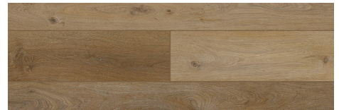
LI-TS102 Toffeenut Umber