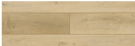
LI-TS101 Sunnyside Up