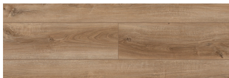
LI-TS107 Skyfall Groove