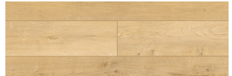
LI-TS104 More Mesa