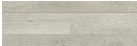
LI-TS103 Almont Haze